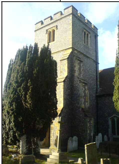
St. John the Baptist, West Wickham