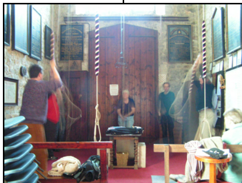
Ringling at Lyminge